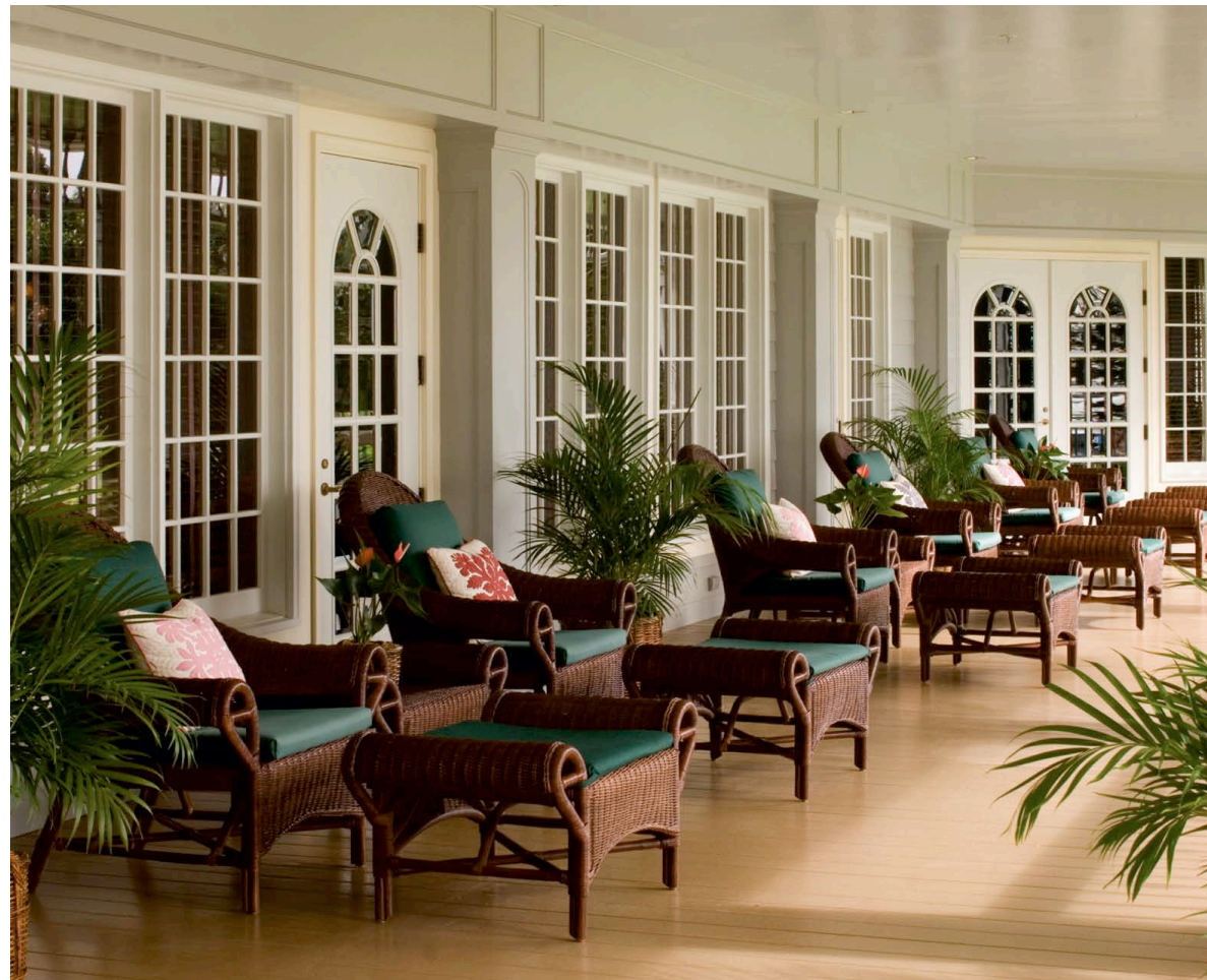
BEACHES AND HIGHLANDS Opposite page from left: all of Turtle Bay’s rooms, suites, cottages and villas are absolute beachfront; Turtle Bay’s beach cottages have 15 foot ceilings and four poster beds. Left: the Lodge at Koele feels like a luxe country manor.

THE ISLANDS OF HAWAII have the happy habit of rapidly decompressing visitors who get enraptured in the swaying of palm trees and hula dancers’ hips accompanied by soft guitars and ukuleles. Exotic flowers abound with hypnotic aromatherapy. The food is equally alluring with Pacific Rim flavours that merge Asian influences with fish, tropical fruits and vegetables grown on volcanic soils.